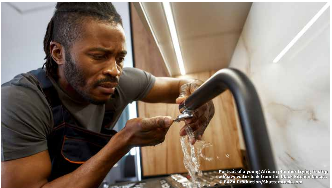
Portrait of a young African plumber trying to stop a heavy water leak from the black kitchen faucet.