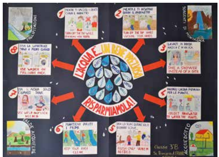
© ITALY - Water Museum of Venice - Water is a Precious Good: Let's Save It! Water Museum of Venice. Primary school “A.Frank” of Spinea, Italy