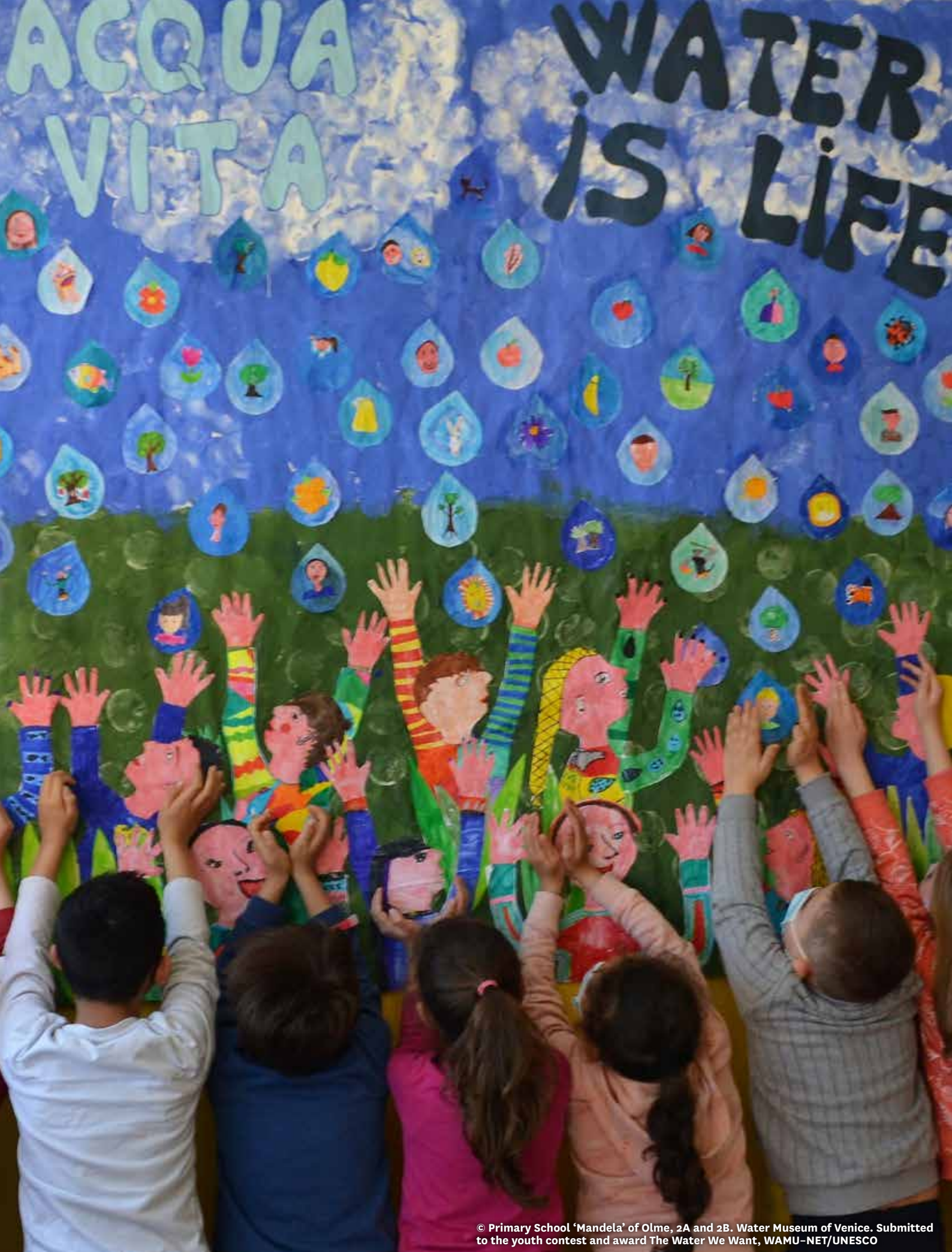
© Primary School 'Mandela' of Olme, 2A and 2B. Water Museum of Venice. Submitted to the youth contest and award The Water We Want, WAMU-NET/UNESCO