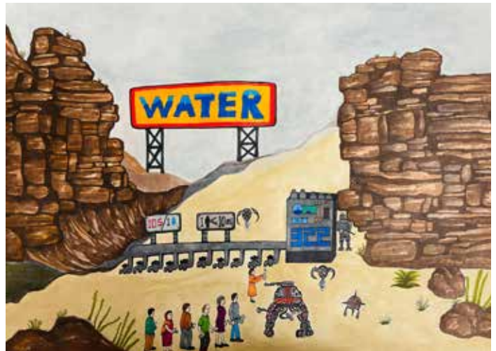
© SPECIAL MENTION CHINA - National Water Museum of China The Water Shop National Water Museum of China. Hangzhou Chovan Century City Experimental School, China. Tong Zeping