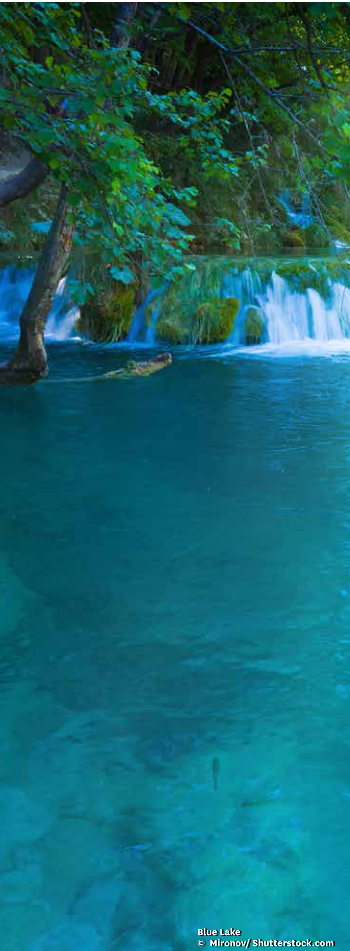
Blue Lake