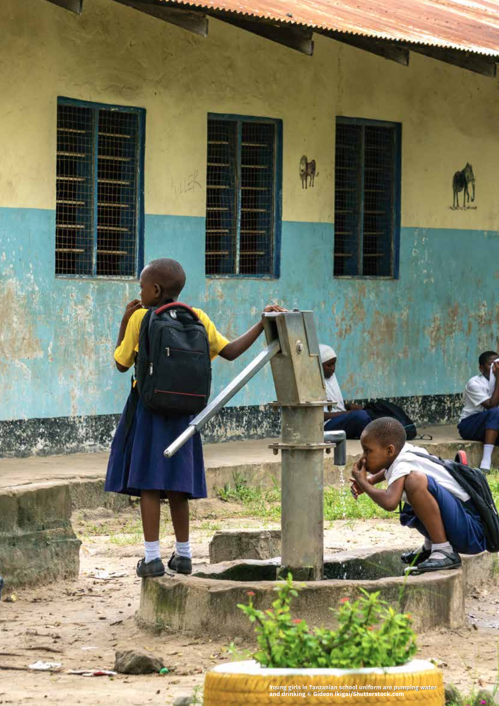
Young girls in Tanzanian school uniform are pumping water and drinking