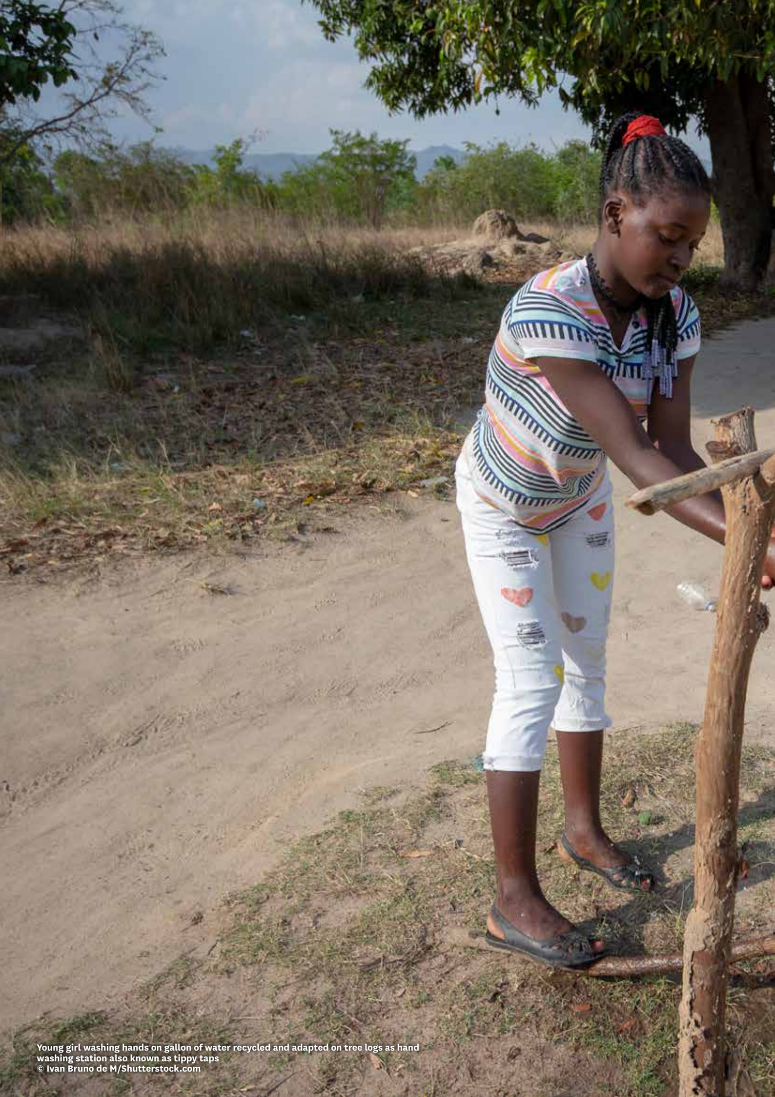
Young girl washing hands on gallon of water recycled and adapted on tree logs as hand washing station also known as tippy taps