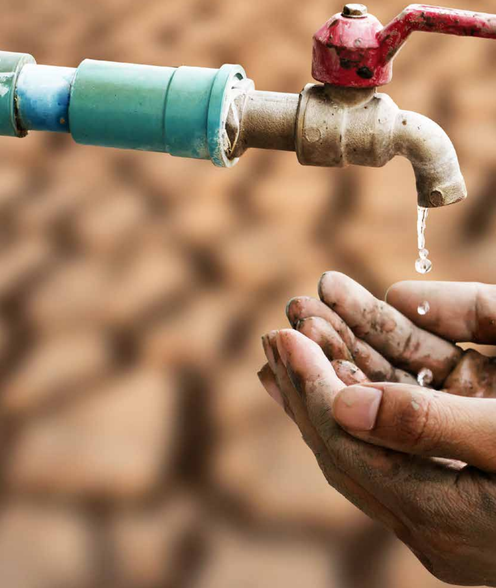
Hand waiting for a drop of water from a tap in the desert. Climate change, water scarcity and crisis concept