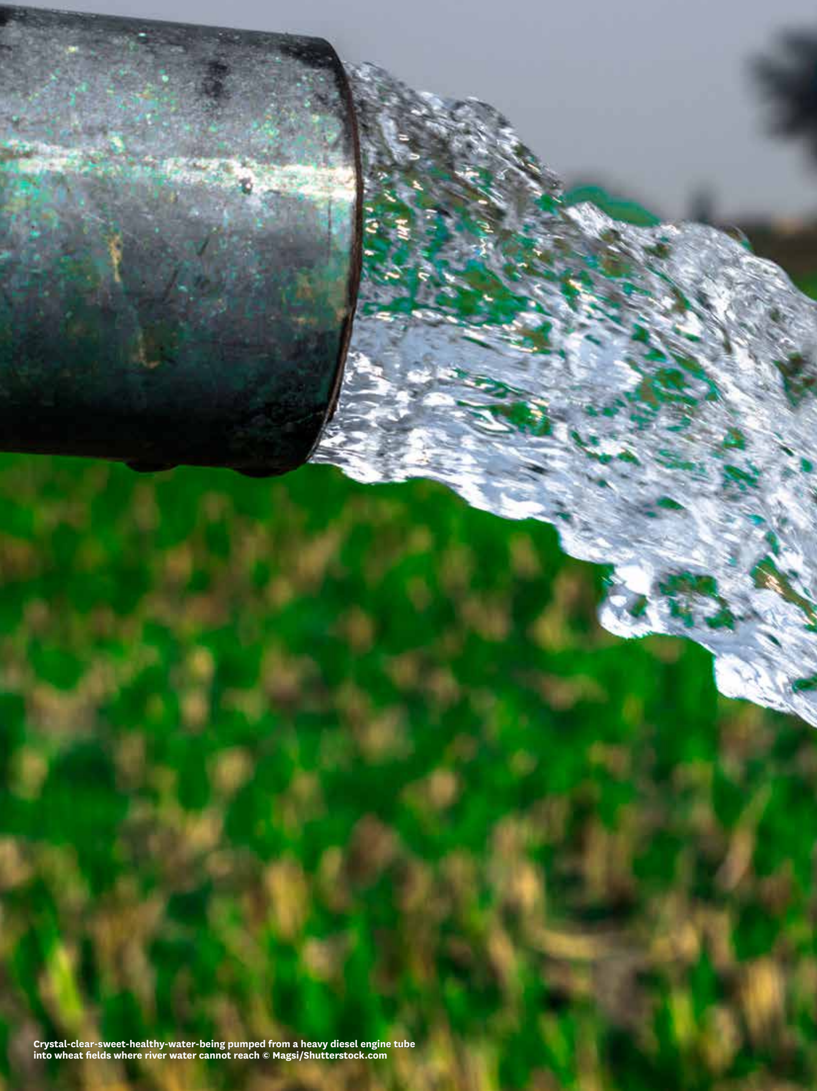
Crystal-clear-sweet-healthy-water-being pumped from a heavy diesel engine tube into wheat fields where river water cannot reach