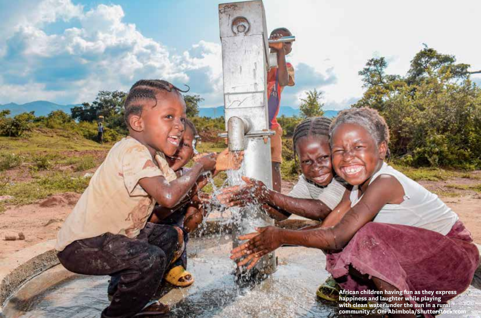
African children having fun as they express happiness and laughter while playing with clean water under the sun in a rural community