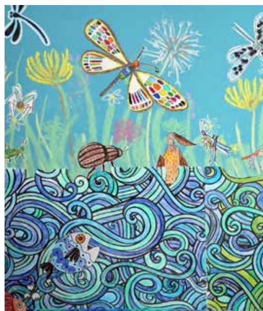
© School 'Nelson Mandela' of Mogliano-Olme, 4A- 4B. Water Museum Of Venice. Submitted to the youth contest and award The Water We Want, WAMU-NET/ UNESCO